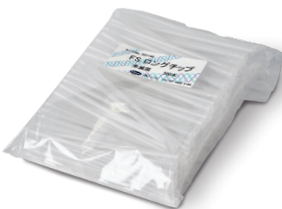
FS Long Tip Bulk 200 Pcs/Pack